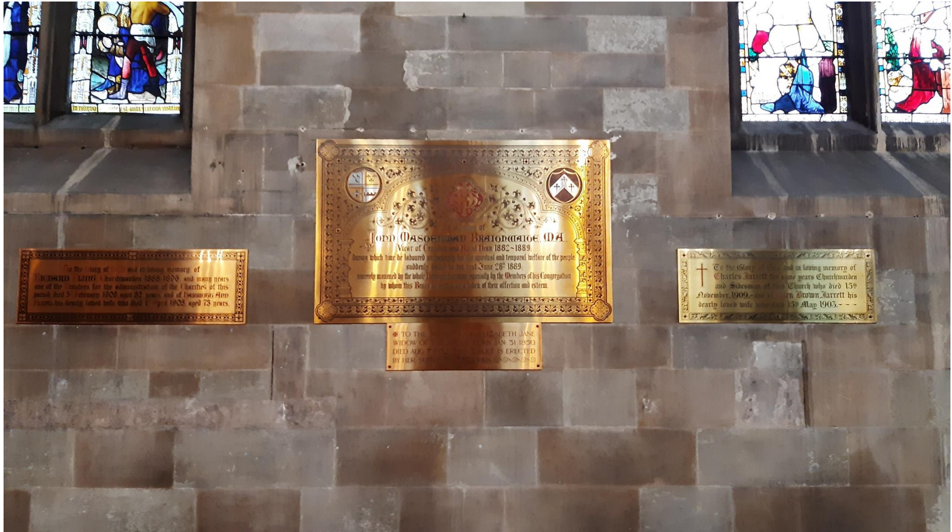
Photograph 3 – adjacent brasses (under window East of proposed plaque)