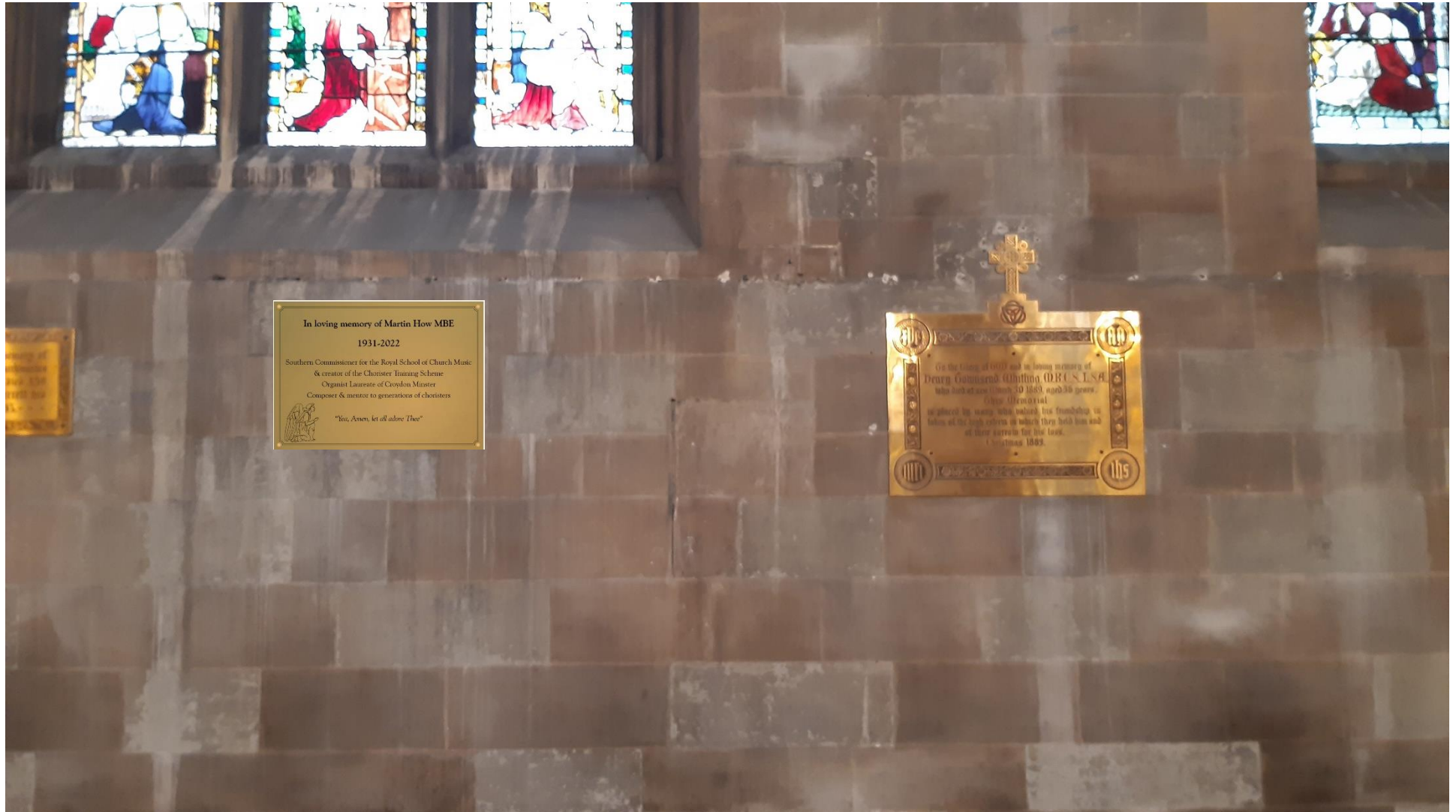
Photograph 1 – Mock up of plaque on South Wall (space left on right for hymn board – see Photograph 2)