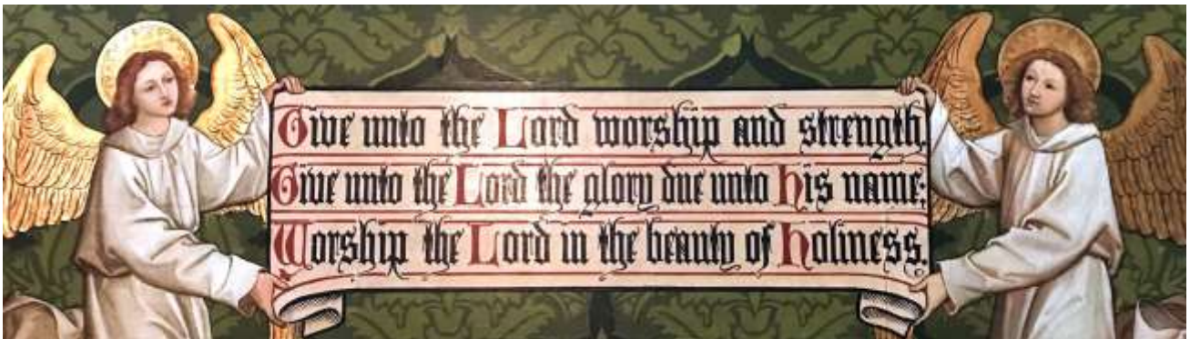
2 Detail of a fresco on south of High Altar

Preaching is undertaken by the clergy and Lay Reader and occasional visiting preachers. With a number of staff there are different styles and voices of preaching offered.