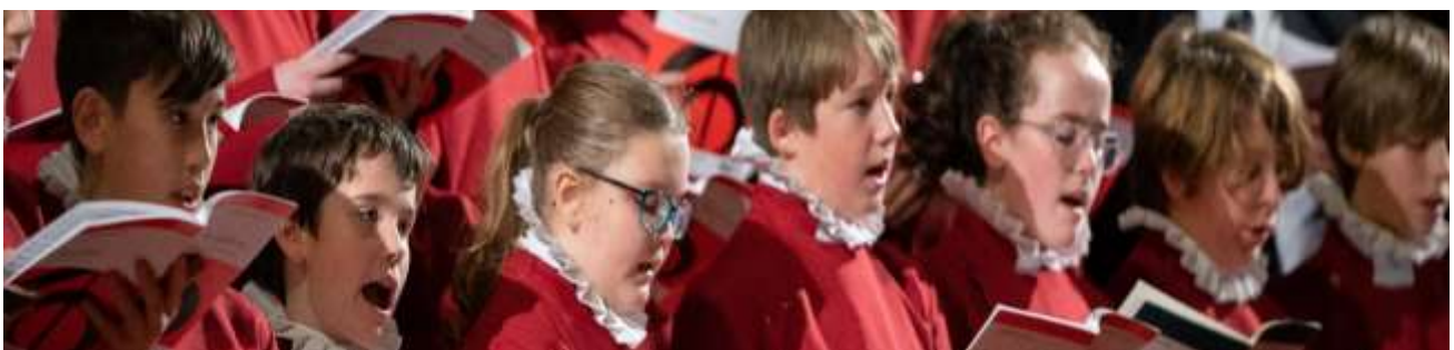
4 Choristers of the Choral Foundation