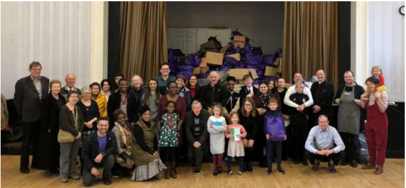
9 Those involved in packing for Separated Child – March 2023

One of our past outreach projects has been the weekly hosting of the Croydon Churches Floating Shelter during the winter months. The project no longer provides accommodation due to new regulations about required amenities which many church halls, including ours, cannot meet. It is unlikely that the project as it was will resume. The project has had to reinvent itself and now, coordinated by Denise Mead, we prepare and provide food for people without shelter in partnership with the charity 'Nightwatch'.