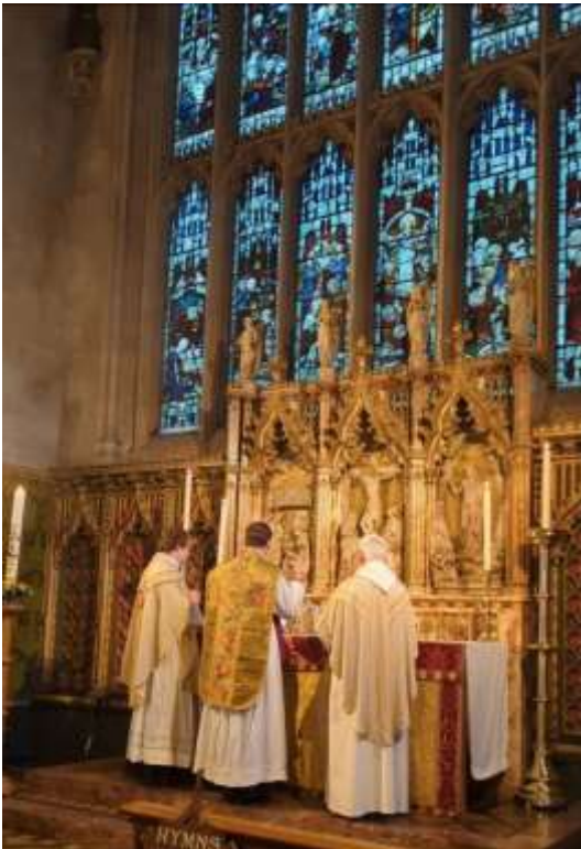
3 Mass for Ascension Day at the High Altar 2024

Tuesday & Wednesday (in term time) – 5.30pm Choral Evensong