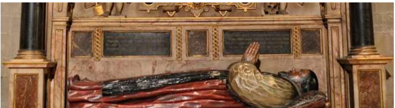
11 Tomb of Archbishop John Whitgift in the St Nicholas Chapel

Our Minster Education Officer continues to research and tell the stories of numerous figures from Croydon and beyond who are associated with the church or buried in or around it.