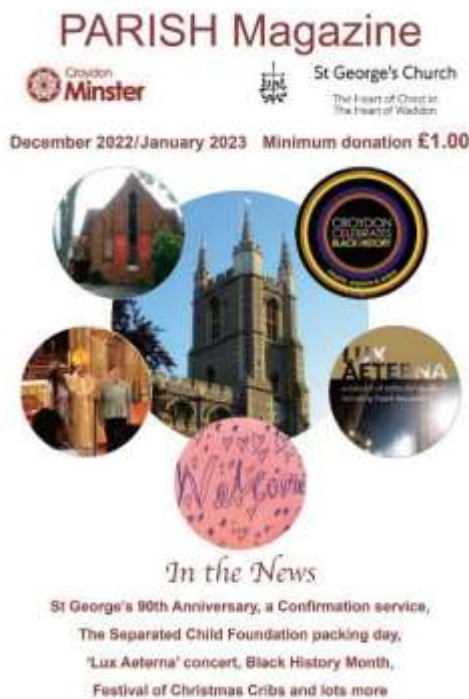
10 Parish Magazine cover January 2023

In 2024 we appointed Trish Kiercek as Communications Officer to develop our social media, internal and external communications.