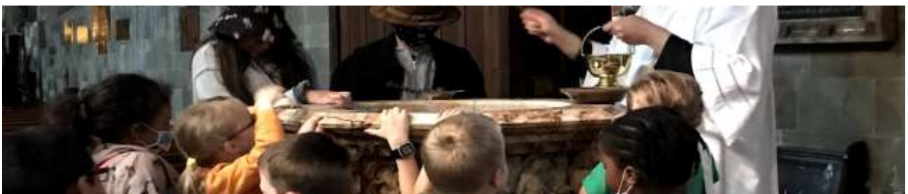
5 Children by the font during a Children & Families' Liturgy

At Candlemas , the Presentation of Christ in the Temple, we made a particular point of praying for discernment of how best to minister to our children and young people. It is an inter-generational scene: a baby brought by young parents, Mary and Joseph, to the Temple, received by the wise, older people Simeon and Anna. It is a model for a church community, made up of different generations gathered in a holy place around Jesus Christ.