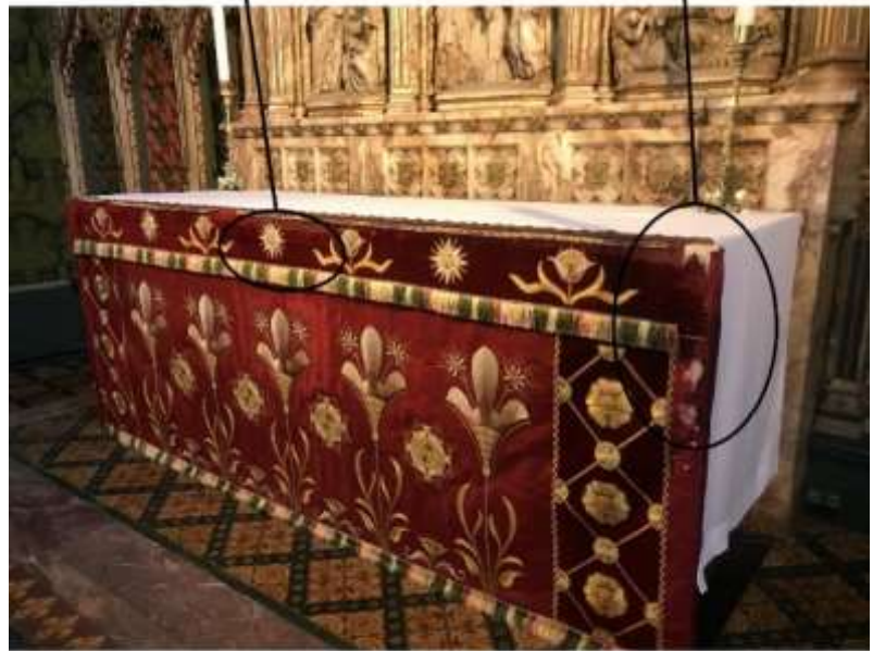
12 The red High Altar frontal is showing significant signs of deterioration

bespoke Candle stand for this significant item of Church furnishing.